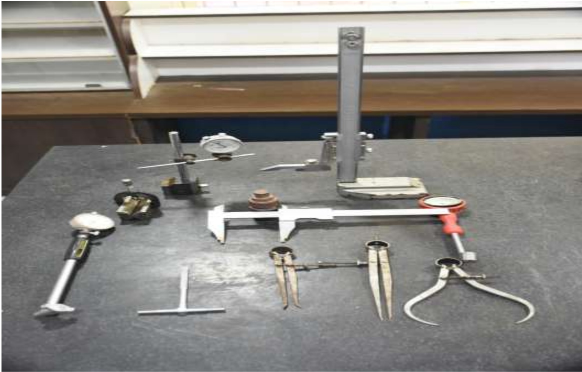
Precision Measurement Lab