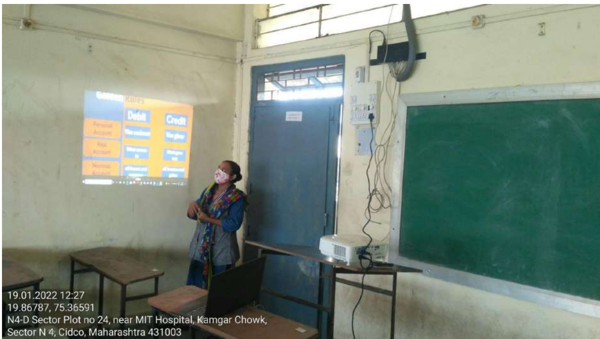
Class Room- C 5