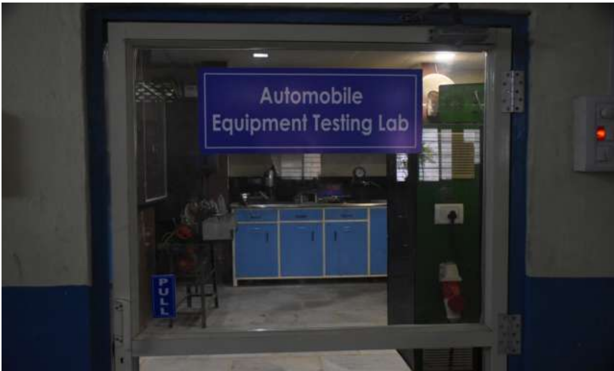
Automobile Equipment Testing Lab