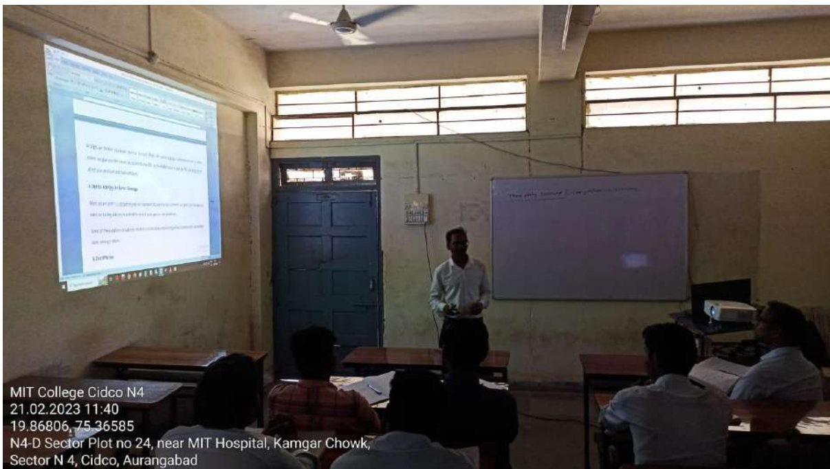
Class Room- C1